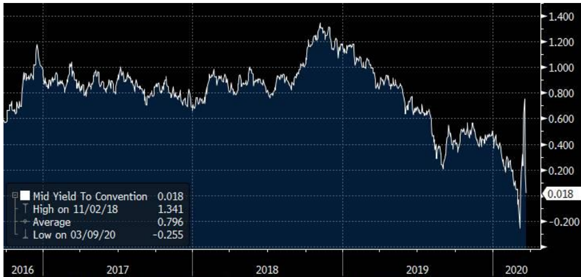
Figure 1: Historic US 10-year TII yields